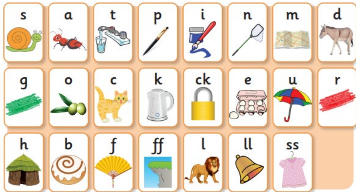
Letters and Sounds Phase 2 Letter sets 1-5

Information from Letters and Sounds: Principles and Practice of High Quality Phonics 2007, licensed under the Open Government License v3.0 http://www.nationalarchives.gov.uk/doc/open-government-licence/version/3 © Crown copyright material contained within this chart is taken from Letters and Sounds, Department for Education 2007