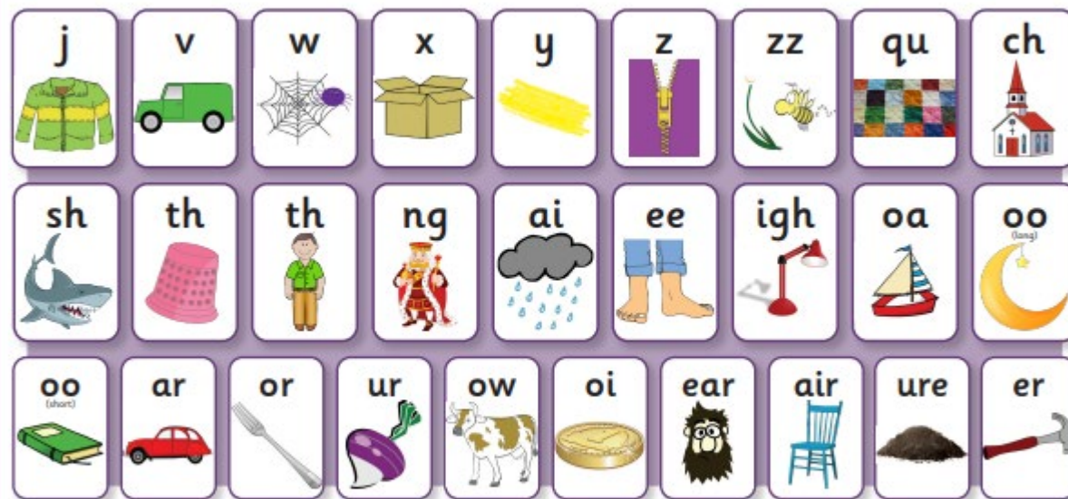
Letters and Sounds Phase 3 Letter sets 6-7, digraphs and trigraphs

Information from Letters and Sounds: Principles and Practice of High Quality Phonics 2007, licensed under the Open Government License v3.0 http://www.nationalarchives.gov.uk/doc/open-government-licence/version/3 © Crown copyright material contained within this chart is taken from Letters and Sounds, Department for Education 2007