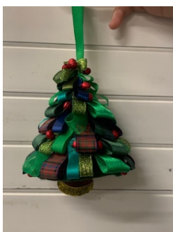
Miss Hodgson's Ribbon tree with bells